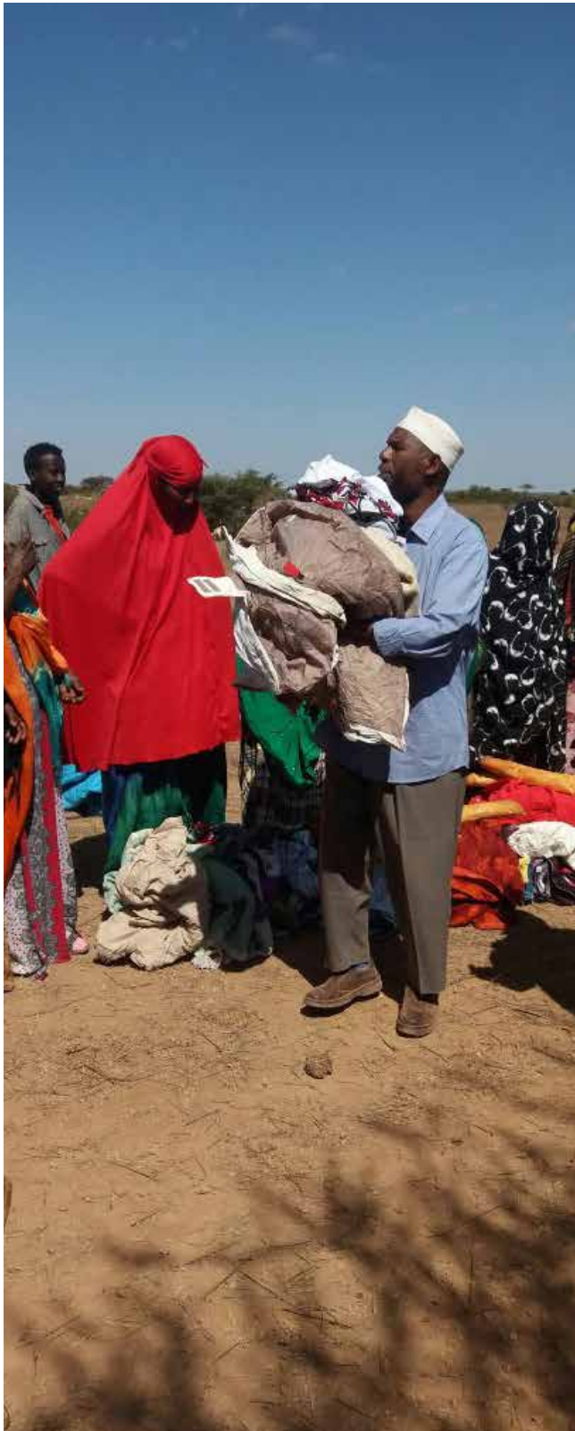
Photo: Handing out emergency supplies during the current drought crisis in Somalia

es of DEMAC focus on conflict-affected regions, this will likely bring partiality issues to the forefront that need to be discussed and examined perhaps through roundtables where all participants can speak freely.