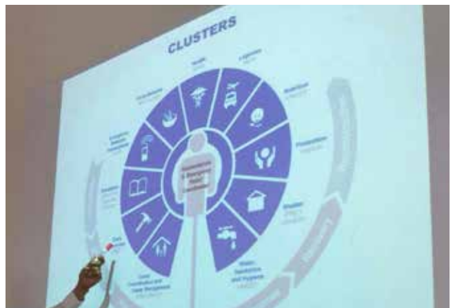
Photo: Presentation of the cluster approach during one of DEMAC’s community workshops.

Clusters are groups in each of the main sectors of humanitarian action that have been designated by the Inter-Agency Standing Committee (IASC) with specific organisations having clear responsibilities for coordination. Through cluster working groups the United Nations Office for the Coordination of Humanitarian Affairs (OCHA) is able to collate information on who is doing what and where (known as the 3W/4W). Leadership is achieved through a Humanitarian Country Team (HCT) under the guidance of a Humanitarian Coordinator (HC). There are many criticisms of the formal humanitarian system, including campaigns to achieve a more inclusive humanitarian system (see for example ODI, April 2016). To date there has been no systematic engagement between the formal humanitarian system and diaspora organisations. Against this background, DEMAC targeted three diasporas (Syrian, Sierra Leonean and Somali) in three countries (Germany,