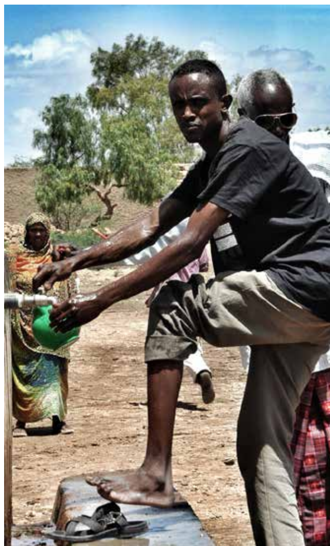
Photo: Local community members in Kalabaid, Somalia, benefiting from extended water pipelines

This report should be read alongside other DEMAM documents available on www.demam.org