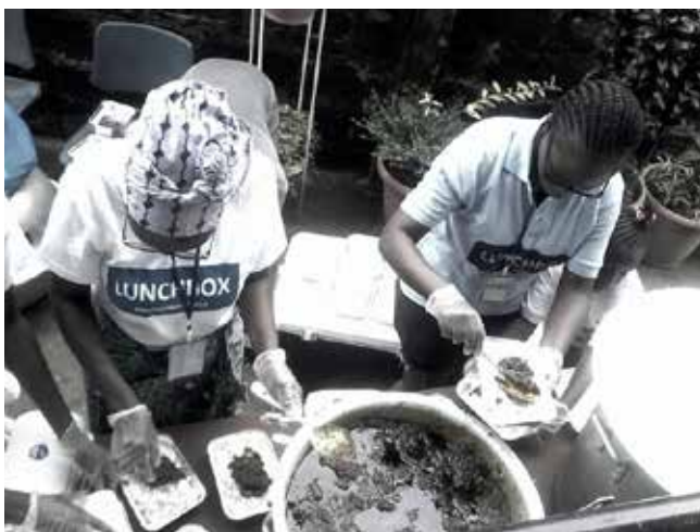
Photo: Photo: Preparation of hot meals for vulnerable communities during the Ebola outbreak in Sierra Leone © The Lunchboxgift project

In order to move discussions about diaspora humanitarianism forward a number of phased activities were implemented, supported by the establishment of an inter-agency advisory board (see Appendix A). Activities included a research/mapping exercise, a series of practi-