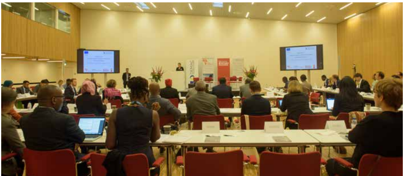
Photo: DEMAC Conference November 2016