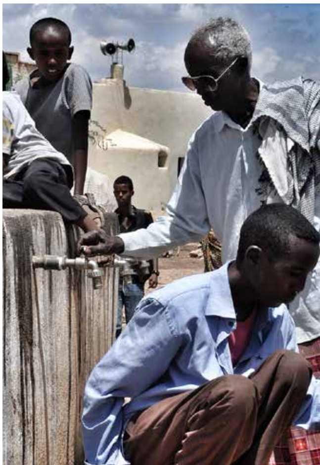
Photo: Local community members in Kalabaid, Somaliland, benefiting from extended water pipelines

Related to this were ideas about diaspora-specific platforms (e.g. Danish-Somali network) and profiles of crisis specific-platforms. Key elements of diaspora organisations need to be clearly articulated including their fluidity, responsiveness, knowledge of local conditions and flexibility. If they are to offer brokerage to organisations in formal humanitarian systems, these advantages should be stressed including the added-value they bring as experts in culture, political motivations and inherent legitimacy.